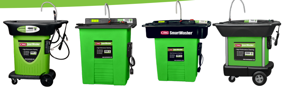
SW-23 Mobile Parts Washer